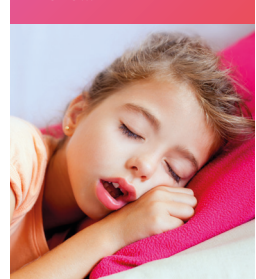
POS Banner Sample (no curve)