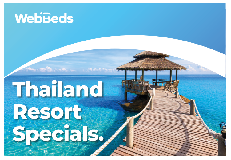
eDM Header sample