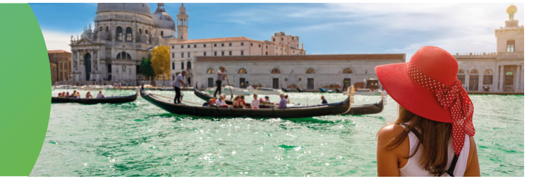
Campaign Banner - Trade Press Ad Sample